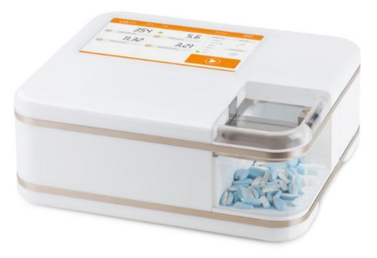
H-Series Advanced tablet hardness testers supports both constant speed and constant force testing